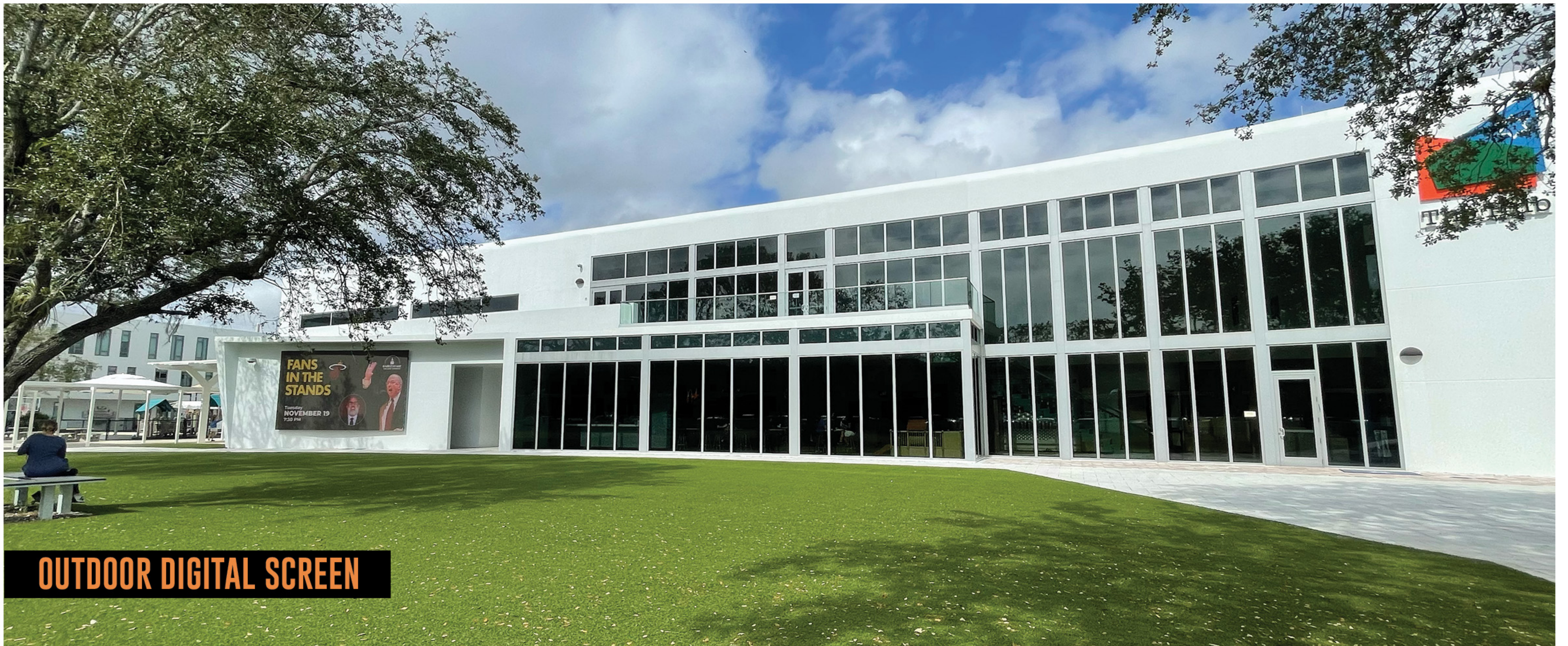
OUTDOOR DIGITAL SCREEN