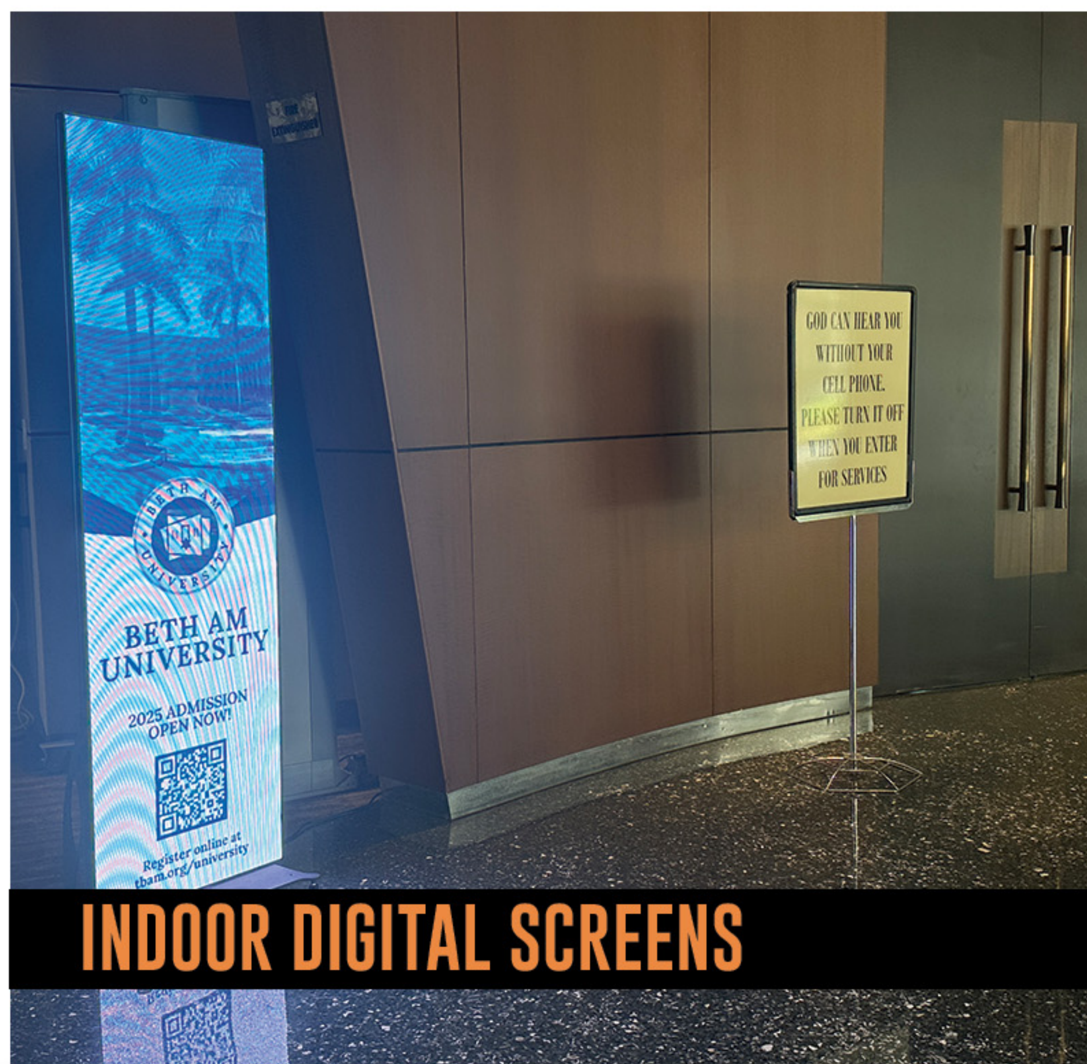
INDOOR DIGITAL SCREENS