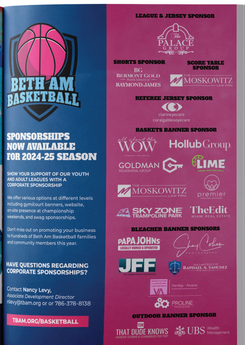
Sponsor listing in monthly Commentator magazine