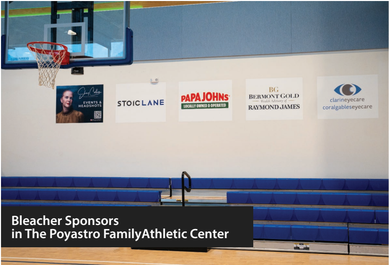
Bleacher Sponsors in The Poyastro Family Athletic Center