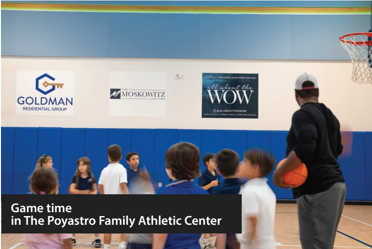
Game time in The Poyastro Family Athletic Center