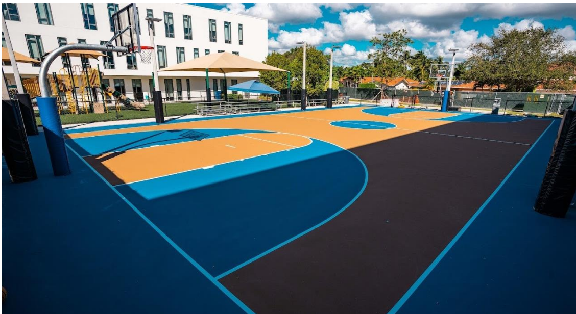
The Havenick Family Outdoor Basketball Court

The Poyastro Family Athletic Center (Indoor Court) and The Havenick Family Outdoor Basketball Court are located at The Hub Building at Temple Beth Am. The Hub Building, the latest addition to Temple Beth Am's dynamic campus, completed in Spring 2023, is the crown jewel of our brand new, state-of-the-art renovated campus. The Hub is a centralized space bursting with activities for our youth, athletics, Basketball League, and Temple programs serving the South Miami-Dade community. The Hub is also home to The Frankel Family Performing Arts Center (Auditorium), Youth Lounge, Top Nosh Cafe, Lunchroom, Multi-Purpose Room, Meeting Rooms, Kitchen, Instructional Pool, and more!