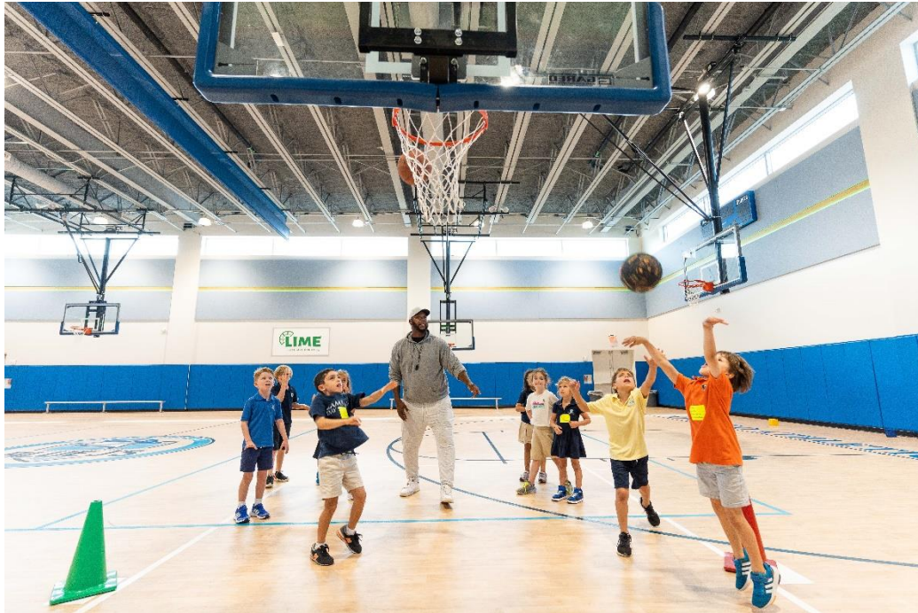
The Poyastro Family Athletic Center (Indoor Court)